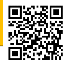
SHARP Learning Portal